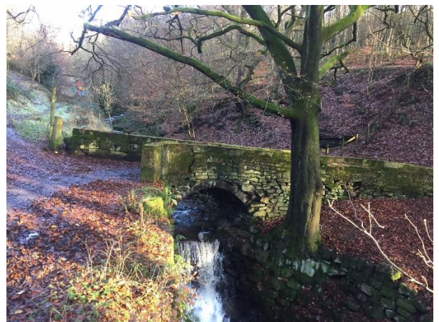
The path as it approaches Hurst Bridge