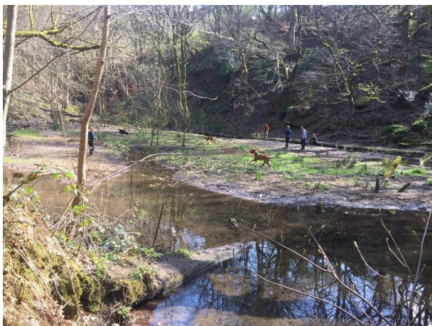
People at play near the pond

The pond in Nutclough used to be an old mill dam to supply water to a sawmill below.